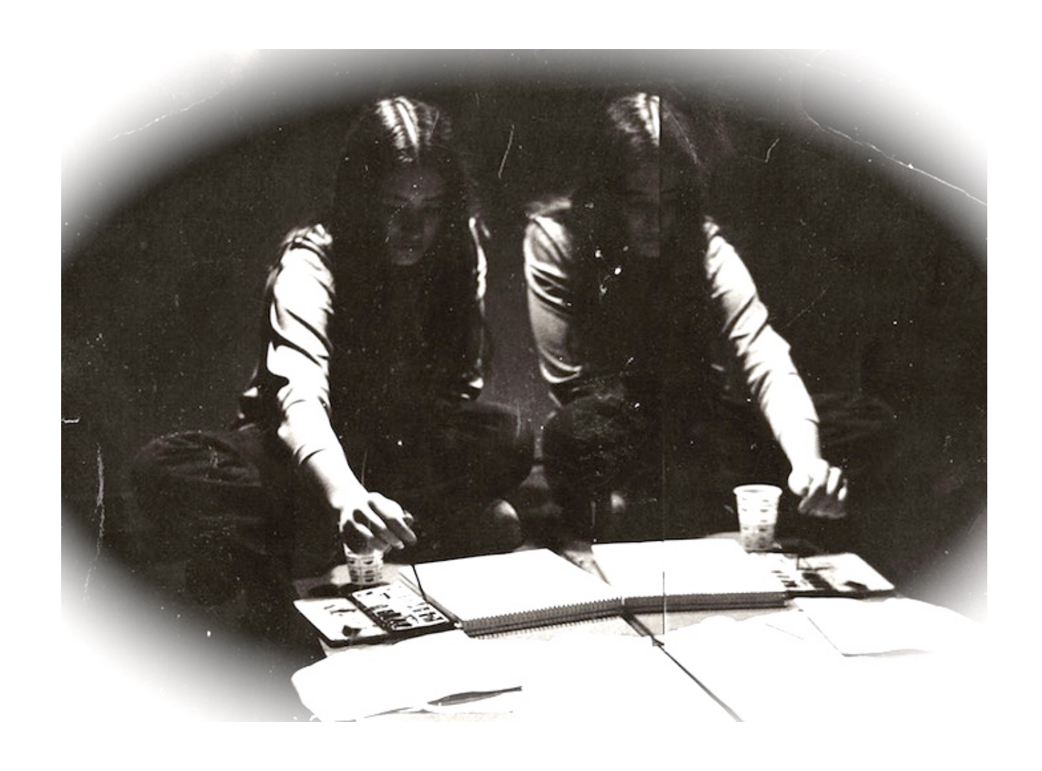
Artist in Mirror, Danville Youth Center, 1971