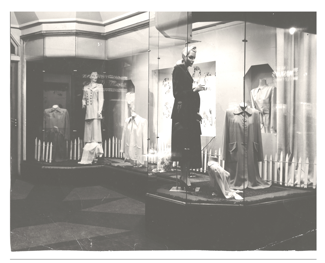
Downtown Danville, circa 1959