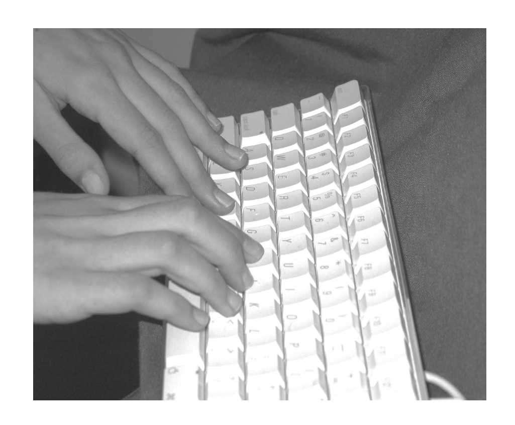
"Digital and Digital" Selection from The System is a Mirror John Wiley & Sons, 2007