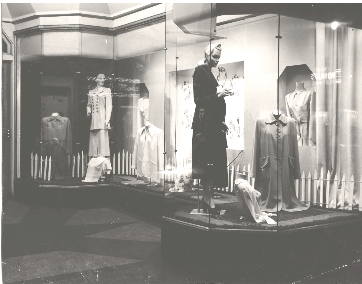
Downtown Danville, circa 1959