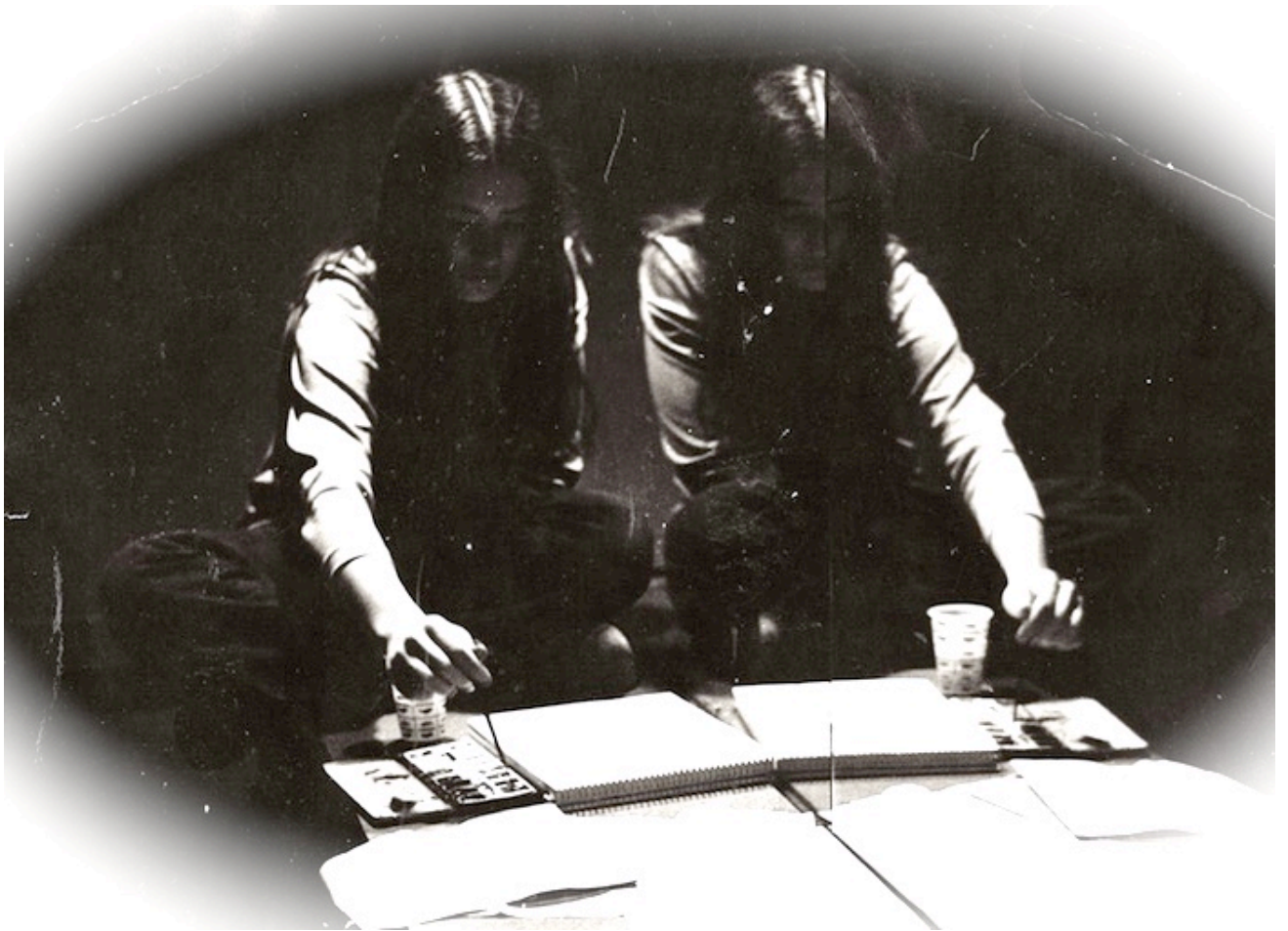
Artist in Mirror, Danville Youth Center, 1971