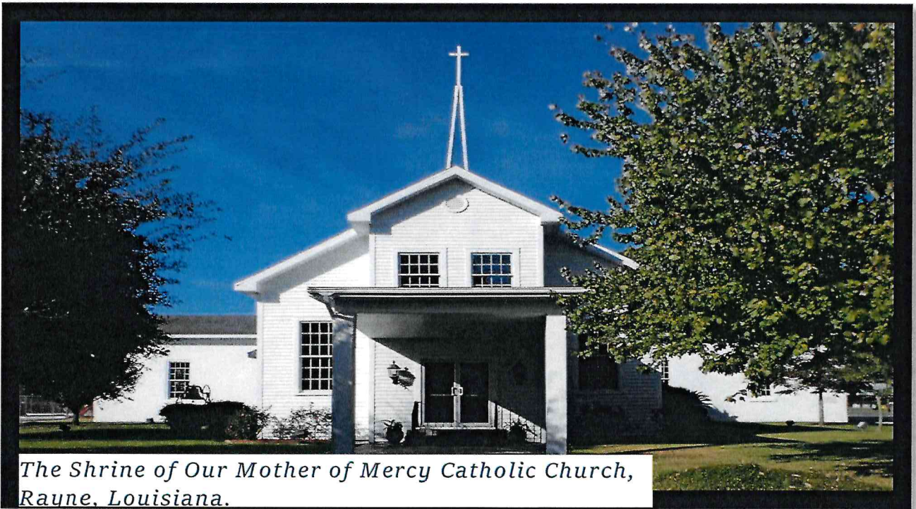
The Shrine of Our Mother of Mercy Catholic Church, Rayne, Louisiana.

Shrine of Our Mother of Mercy Staffed by the Josephite Fathers since 1924