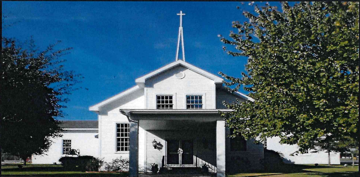
The Shrine of Our Mother of Mercy Catholic Church, Rayne, Louisiana.