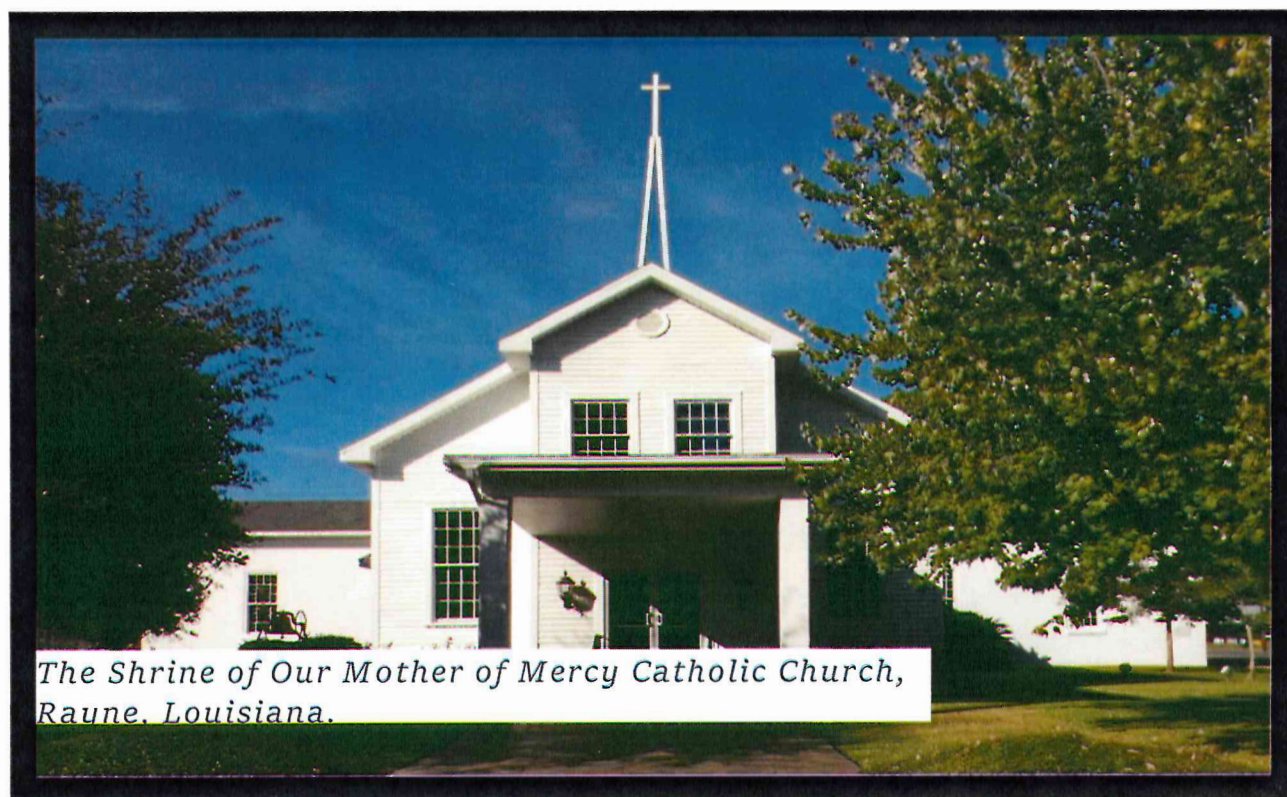
The Shrine of Our Mother of Mercy Catholic Church, Rayne, Louisiana.