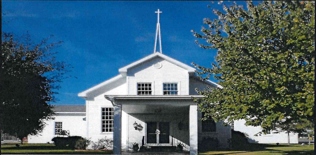
The Shrine of Our Mother of Mercy Catholic Church, Rayne, Louisiana.

Shrine of Our Mother of Mercy Staffed by the Josephite Fathers since 1924