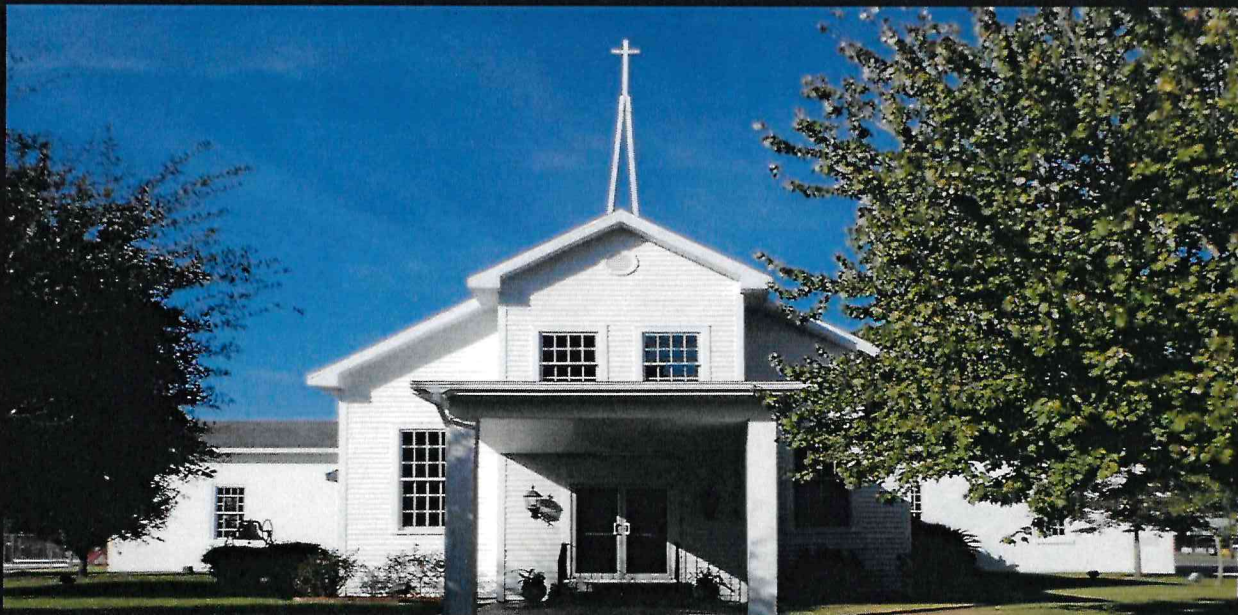
The Shrine of Our Mother of Mercy Catholic Church, Rayne, Louisiana.