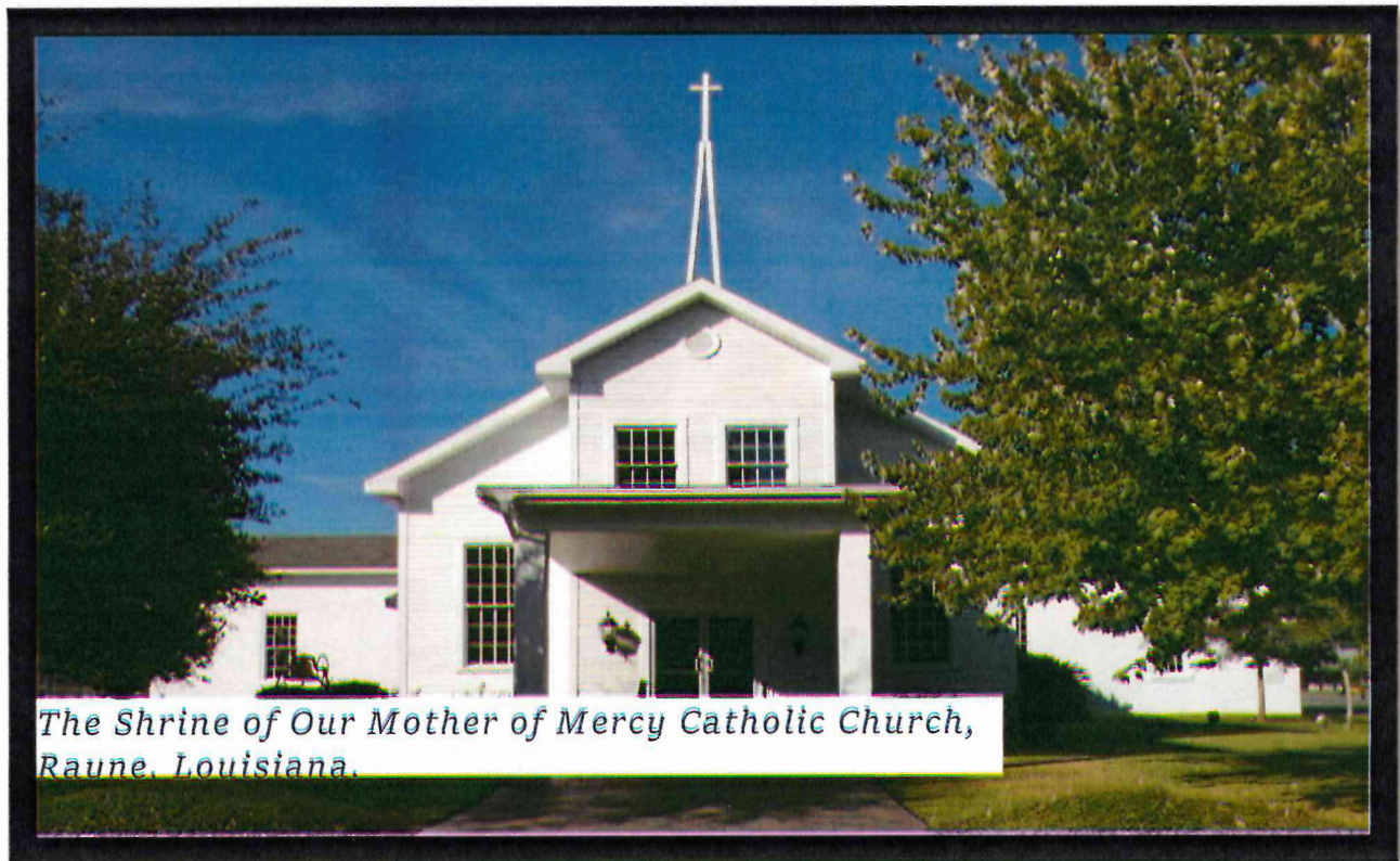
The Shrine of Our Mother of Mercy Catholic Church, Rayne, Louisiana.

Shrine of Our Mother of Mercy Staffed by the Josephite Fathers since 1924