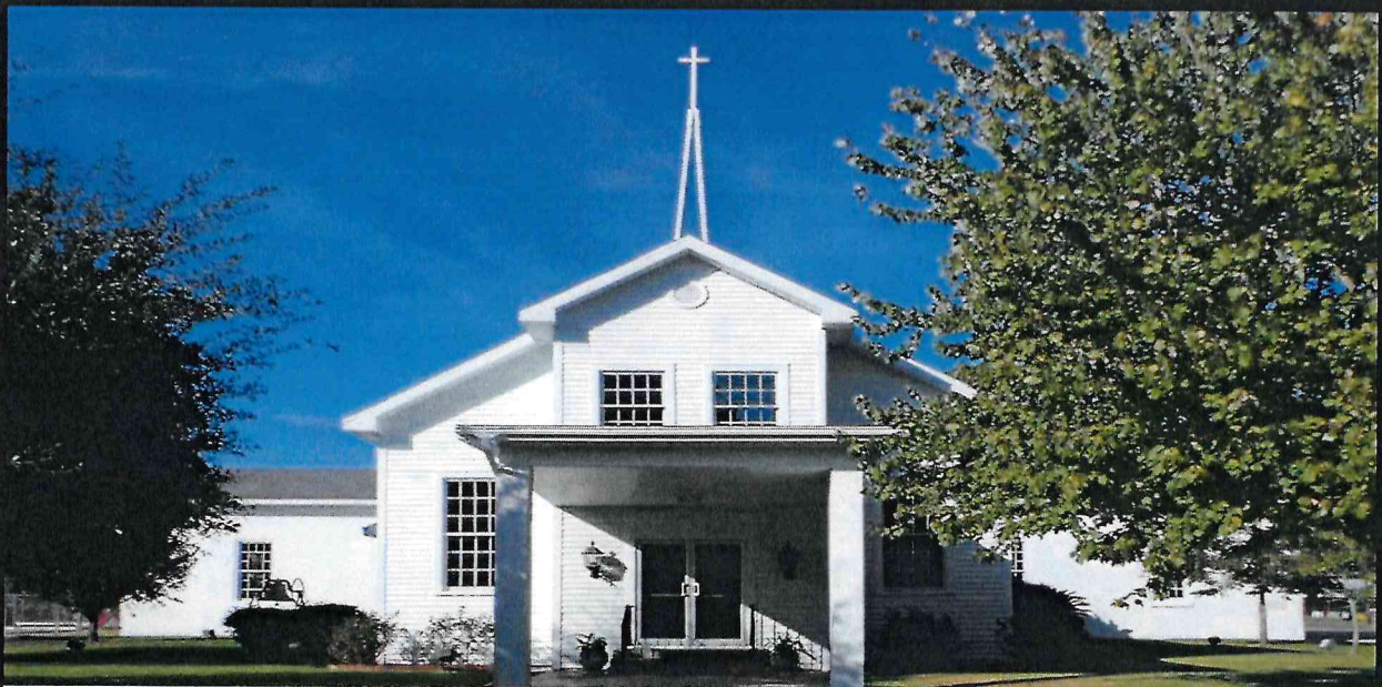
The Shrine of Our Mother of Mercy Catholic Church, Rayne, Louisiana.