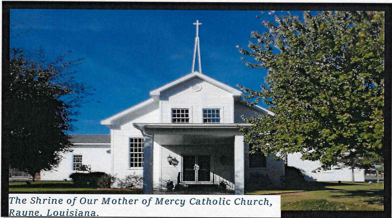
The Shrine of Our Mother of Mercy Catholic Church, Rayne, Louisiana.