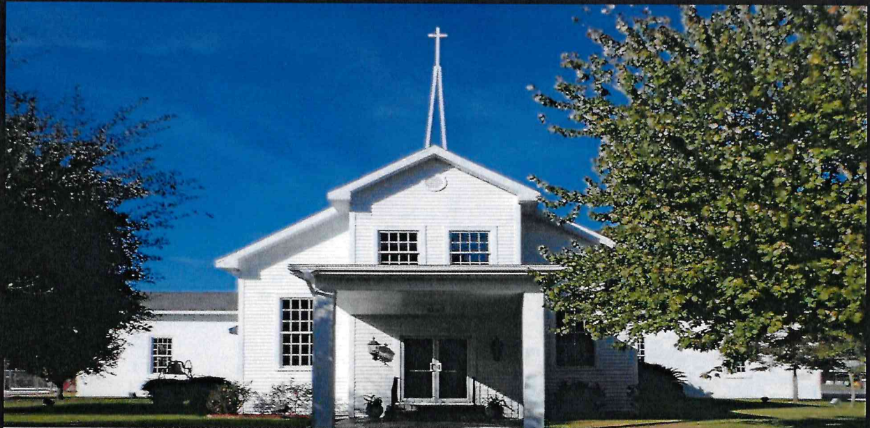
The Shrine of Our Mother of Mercy Catholic Church, Rayne, Louisiana.