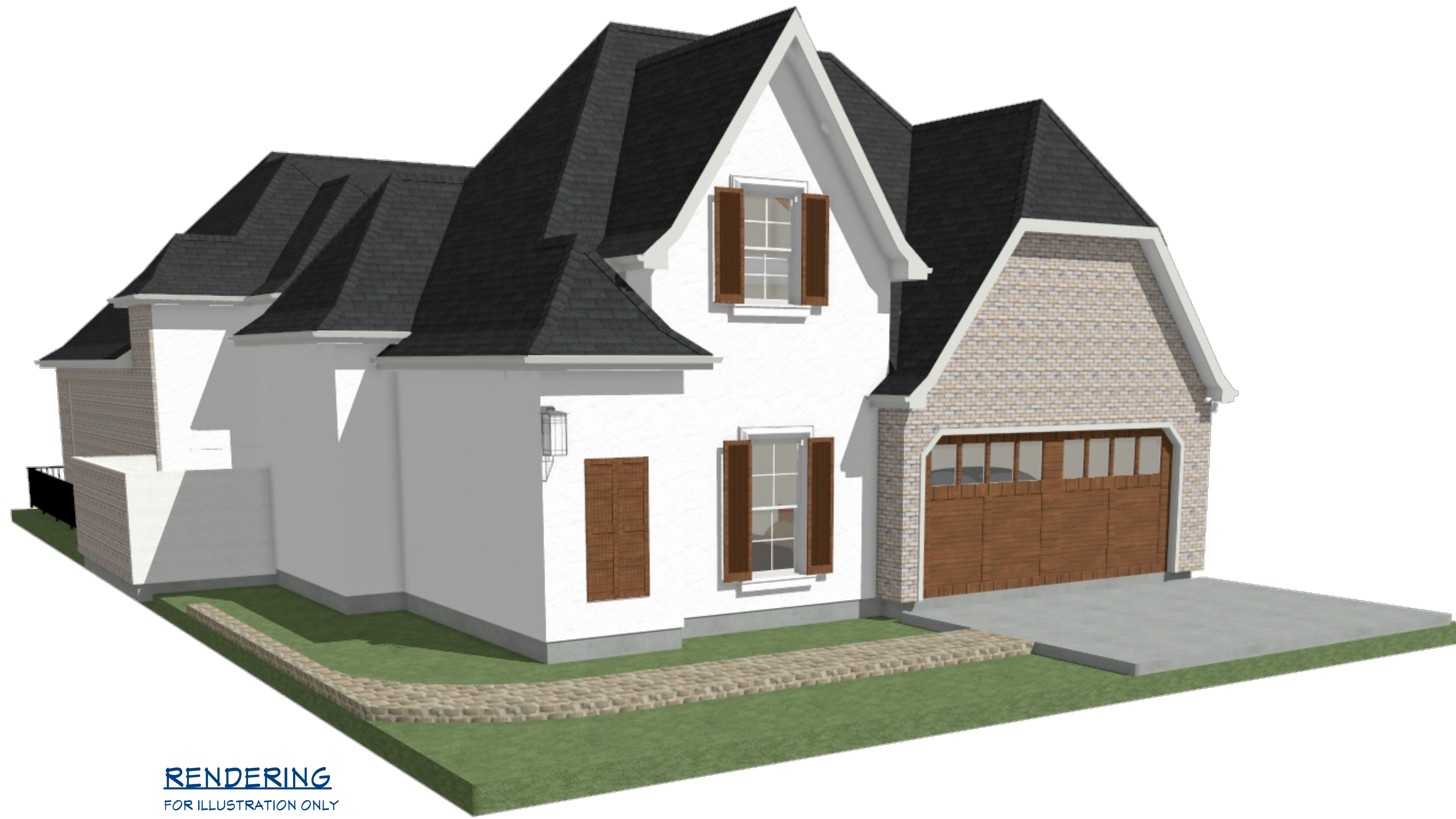
RENDERING FOR ILLUSTRATION ONLY