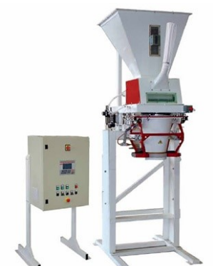
MANUAL BAGGING STATION