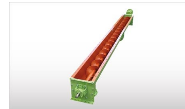
WAM SCREW TRANSFER