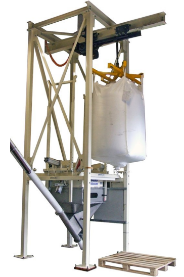
BULK BAG FILLING AND UNLOADING