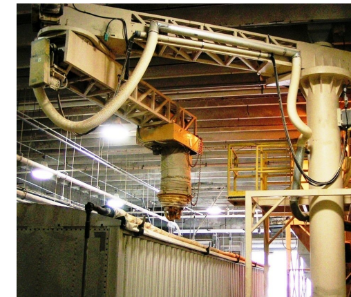
DYNATEK ARTICULATED LOADING CONVEYOR