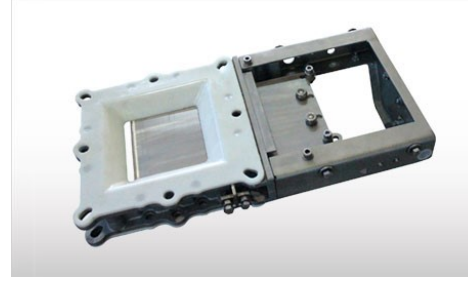
LOW PROFILE SLIDE GATE