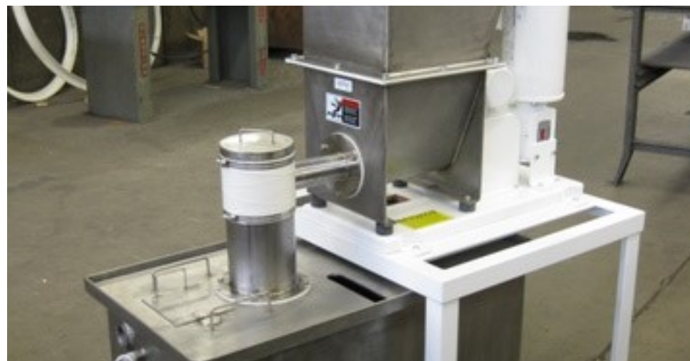
LOSS IN WEIGHT FEEDER