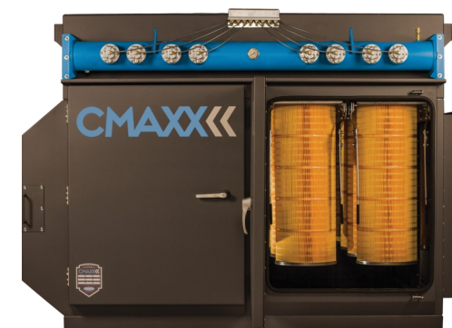
CMAXX - INDUSTRIAL DUST & FUME COLLECTION