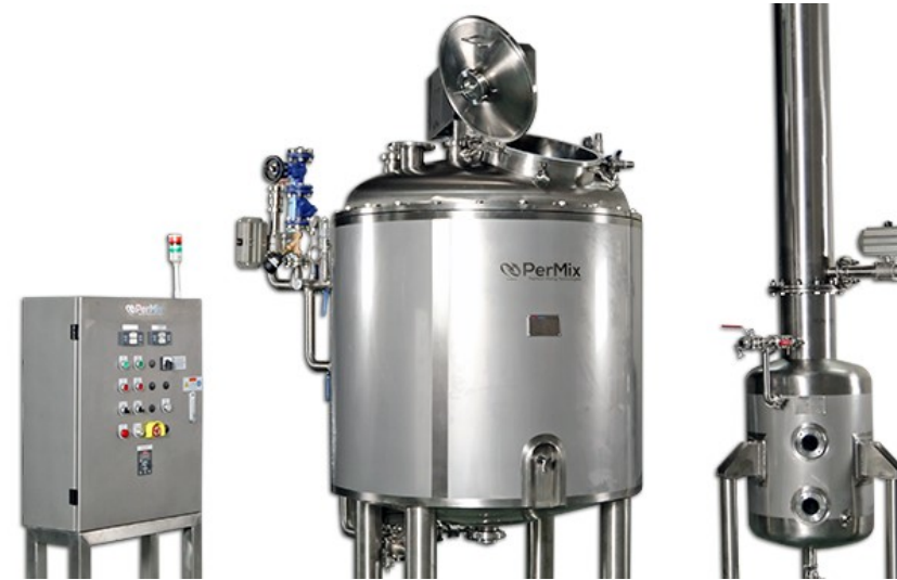
PerMix STAINLESS REACTORS AND CONDENSERS