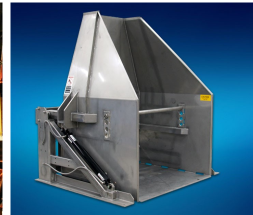
TRITON BOX DUMPER CARBON OR STAINLESS STEEL