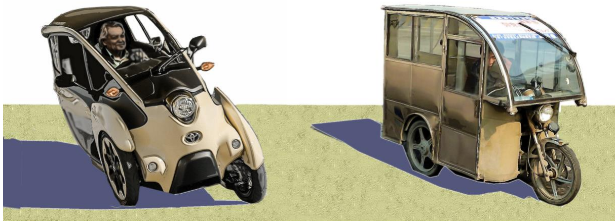
The Toyota i-Road personal mobility vehicle (left) and the Beijing three-wheeler (right) provide on-demand trips from station to door, and door to station

I provide a few examples of this in my book, in fact, for example: