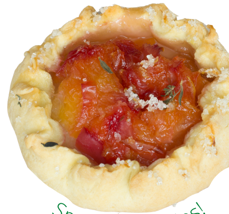
Small Peach Pies!

2 cans Peach Pie Filling, 2 cans Peaches in Syrup for the dessert of Small Peach Pies using Julia Child's Pie Crust: 1 1/2 C Unbleached Flour , 1/2 C Cake Flour , 6 oz cold Salted Butter , 4 T Butter Flavored Shortening , & 1/2 C Ice Water . We will roll it out and whip up our extra peachy pies!