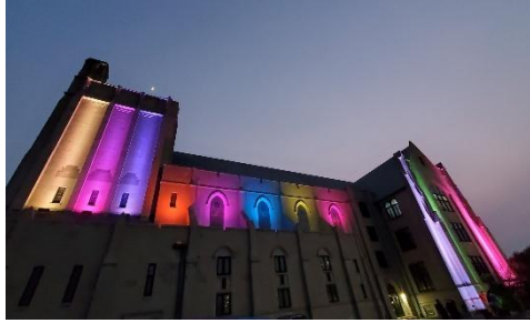
(Light Up Pride 2025 photo)