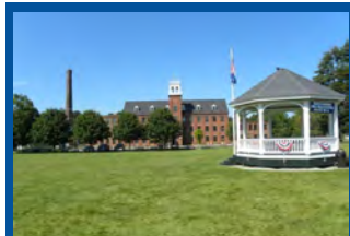
North Berwick Woolen Mill (after)

Thousands of properties have been assessed and cleaned up through the Brownfields Program,