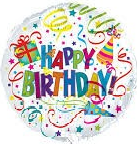
Happy 90th Birthday, Dickie!