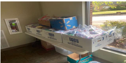
10 Cases ready to head to Africa!

This year the Hiwassee District Hands-On Mission Project goal for our church was 50 health kits and at last count our community has collected 90 kits! Our District goal was 400 kits so