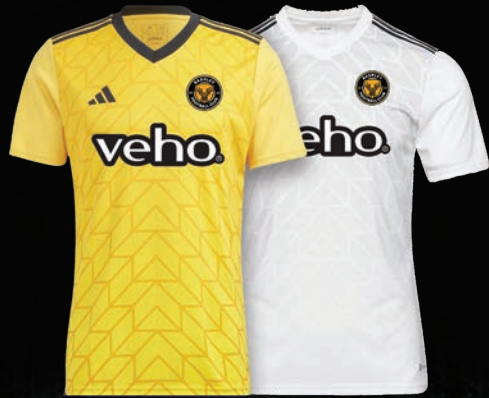
24/25 Home & Away Shirts