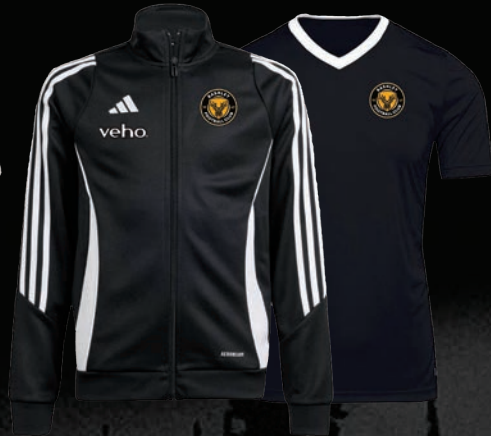
24/25 Training Kits