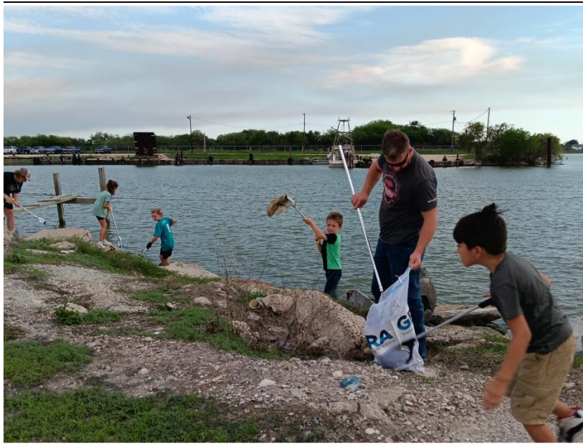
At Navigation District Harbor