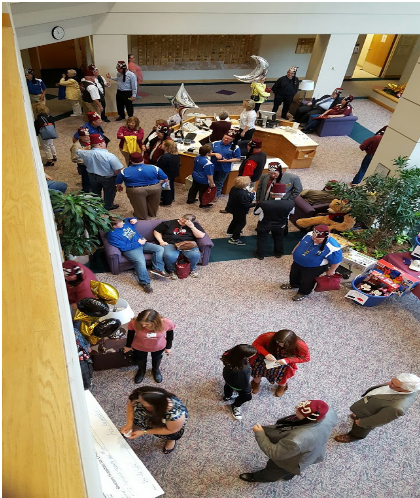
The Lobby at the Twin Cities Hospital.