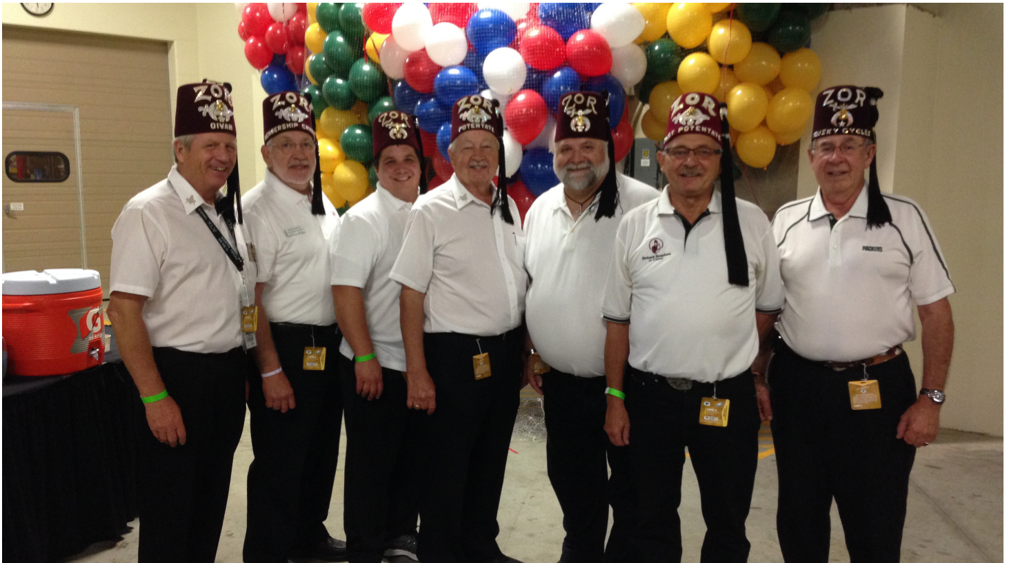
Zor Shriners near the 'Tunnel' at Lambeau Field - Aug 29 2015