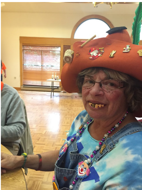
One of our gorgeous ladies at the May Steak Fry at Zor Temple. Beautiful!