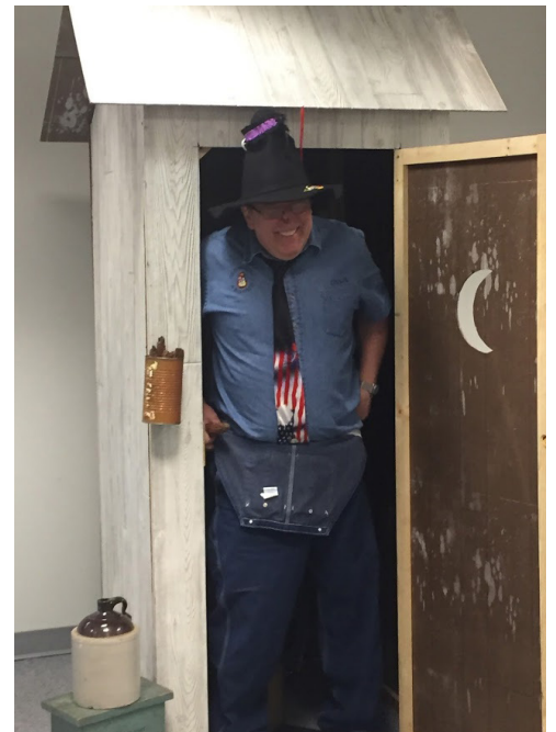
The indoor Potentate Plumbing seemed in good order