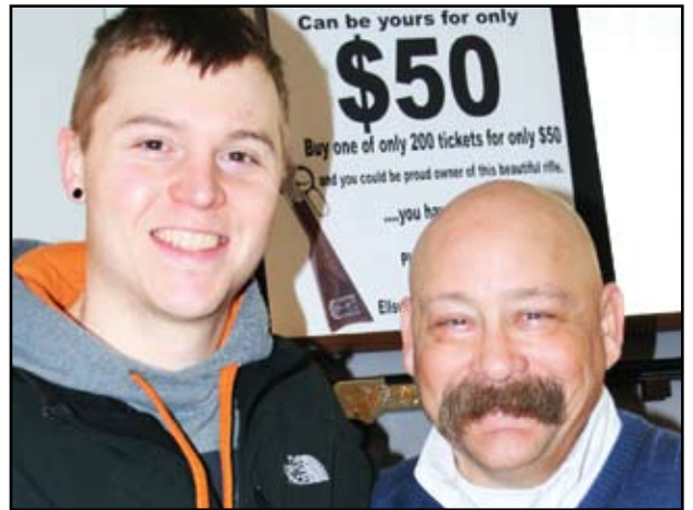
Pancake Breakfast receives visitor from Wisconsin Grand Lodge