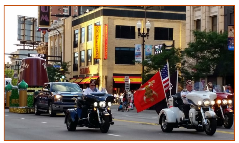
One of the many parade units at the Imperial parade, this one featuring our Brothers from MN.