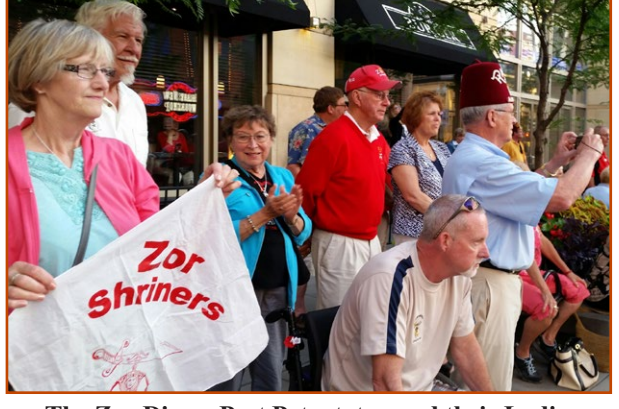
The Zor Divan, Past Potentates, and their Ladies showing their support for our parade units.