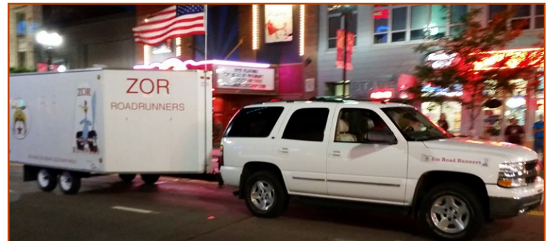
Roadrunners representing Zor at the Imperial parade.