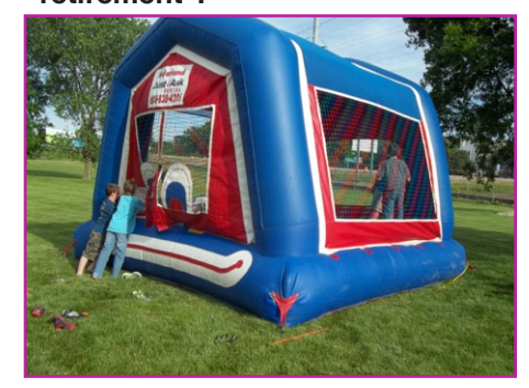
The bounce house never stopped bouncing.