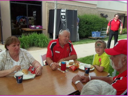
The Steibers with their high decorated grandson.