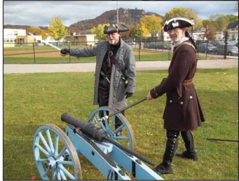
The Pirates fired a shot every time the UW-L Eagles scored.