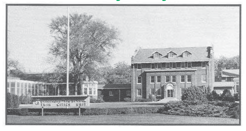
Above, original facility. Below, current facility.

Shriners Hospital for Children – Twin Cities: Celebrating the 90th Anniversary May 18th