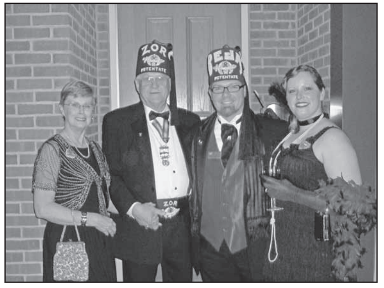
Zor & Beja Shriners' Potentates and their lovely Ladies.