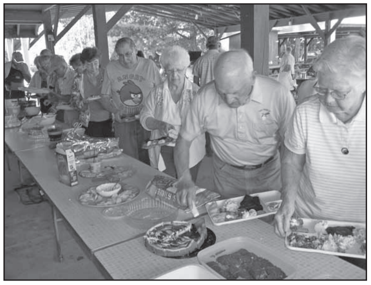
The hungry Nobility lining up for a great meal.