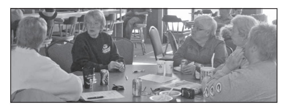
Packer games aren't just for the guys as the ladies were also enjoying the game.