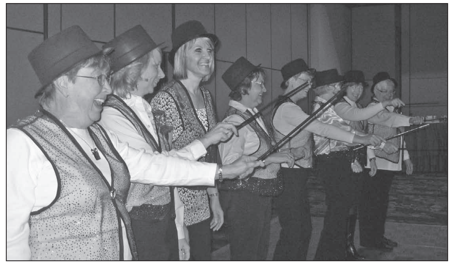
The Dancing Divan ladies are struttin' their stuff. Hours and hours of practice paid off.

is passionate and all the Nobles wrap themselves around it. It seems to me that there is good line coming up.'