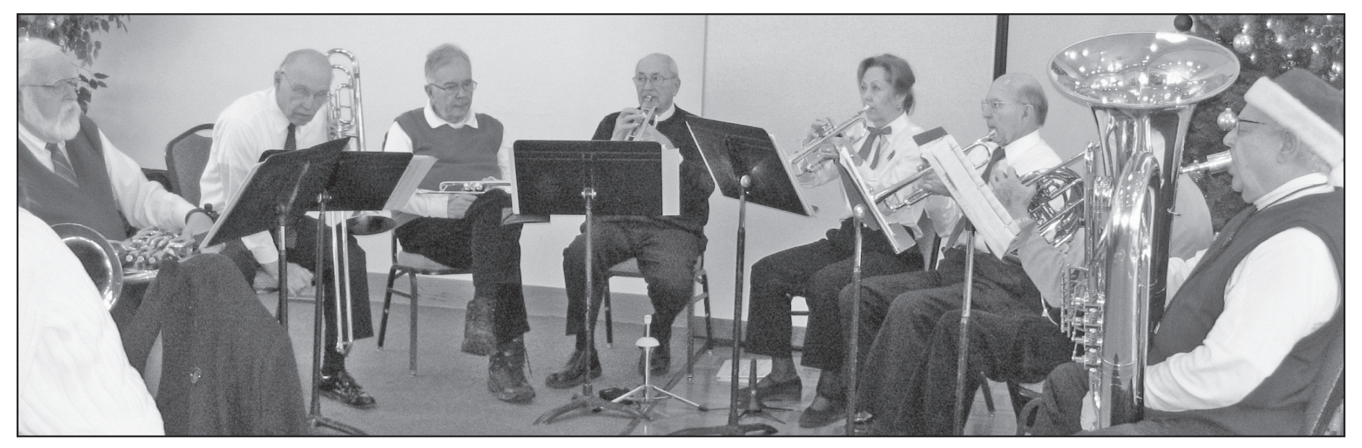
The Concert Band played holiday tunes during lunch to add a bit of spirit and cheer to Hankwitz Hall.

With nearly 90 guests at the Shrine Center, Santa and Mrs. Claus were welcomed with open arms and hearty handshakes at the annual Lunch with Santa. There were many younger children, and several of them weren't quite sure if they wanted to get too close to the jolly old elf, but still took their turn on his lap as he shared candy and gifts. Santa was