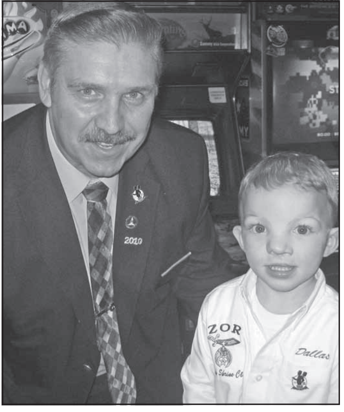
Potentate Joe and King Dallas.