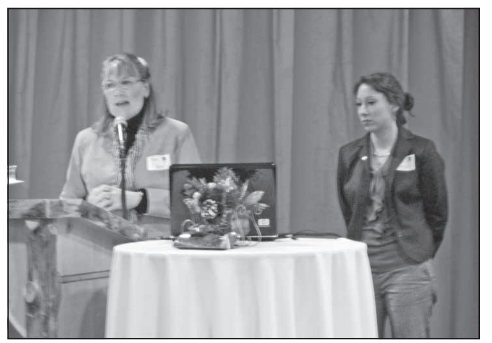
Speech pathologists from the Chicago Shriners Hospital for Children shared their experiences with the patients they help.