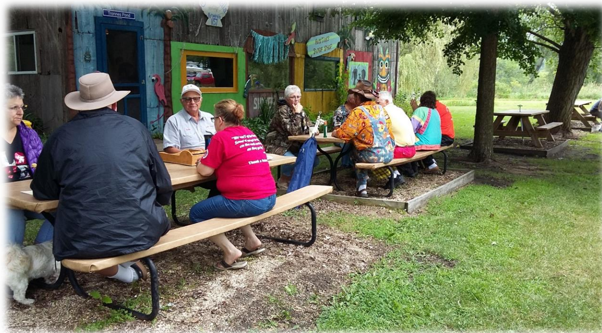
Pre-picnic visitation following the Edgerton parade

Meetings are held at Rays Family Restaurant in Edgerton @ 6:30 p.m. September 27, October 25