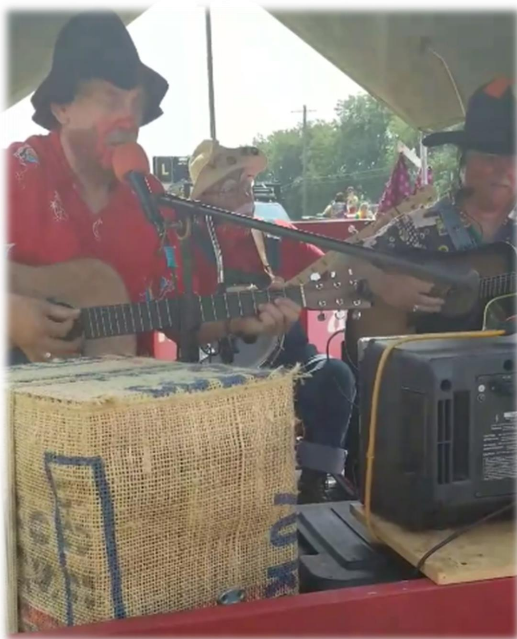
Zor Mountain Boys singing from the Heartland!