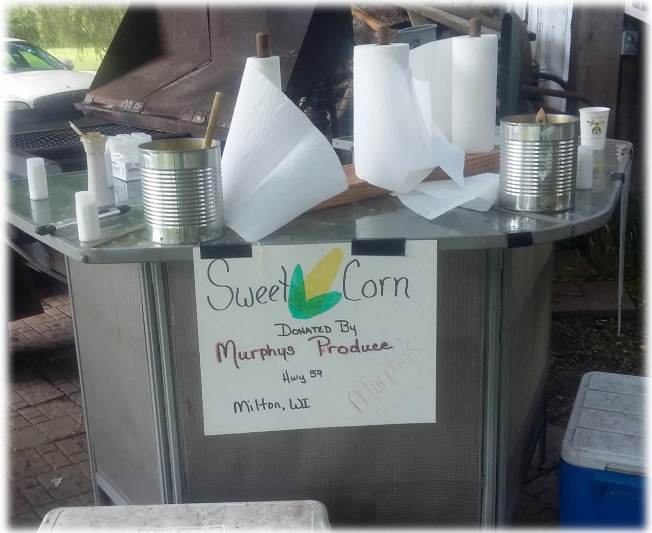
25 dozen ears of corn where donated for the Mini car picnic