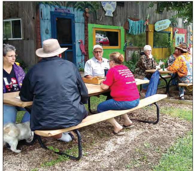
Pre-picnic visitation following the Edgerton parade.