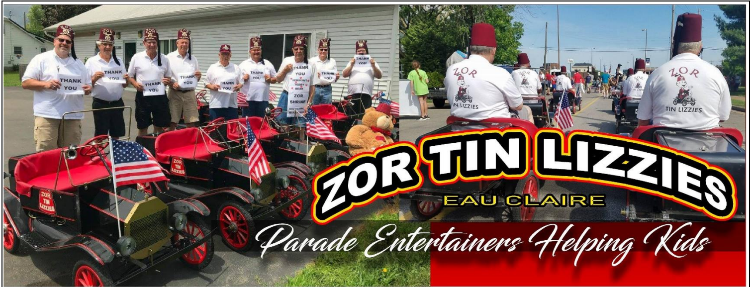
Getting ready for the Ettrick parade