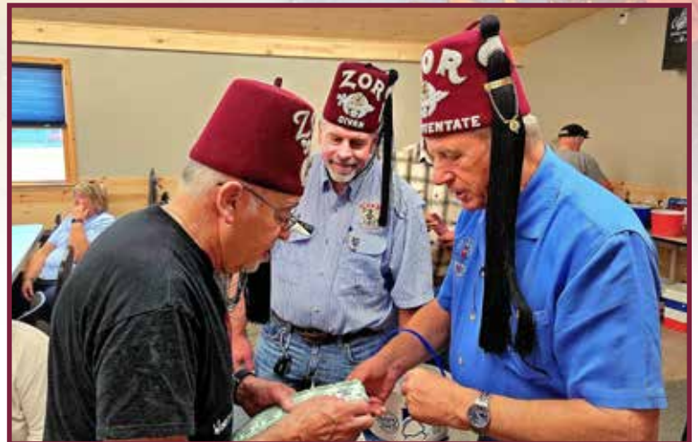
HAYWARD MUSKY SHRINERS ATV & UTV RALLY PG 14-15