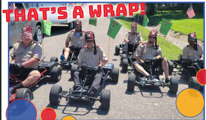
PARADE WRAP-UP PG 16-17