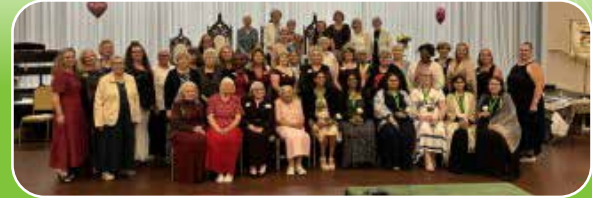
Members from both Antioch and Alabet Temples