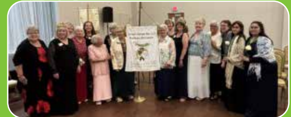
Antioch Temple members