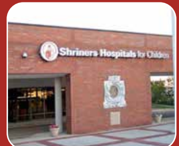
Chicago Hospital 773-385-5400