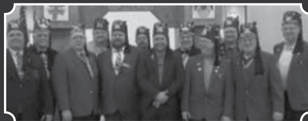
Nobles from St. Croix under the arch