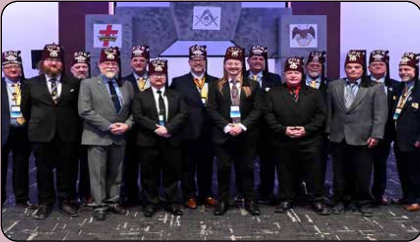
Pictured : New Nobles with the 2025 Divan