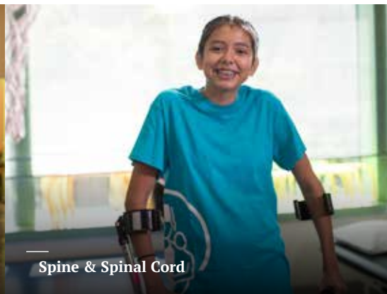
Spine & Spinal Cord