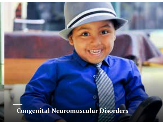
Congenital Neuromuscular Disorders