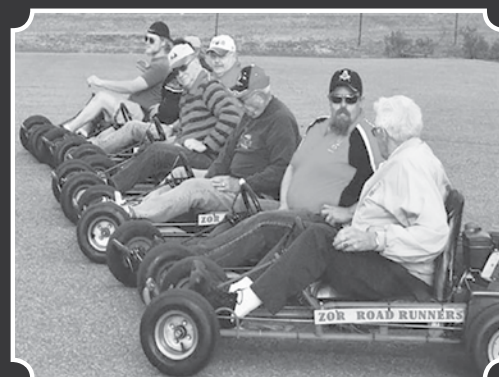
First Road Runner practice of the season - at parade rest.