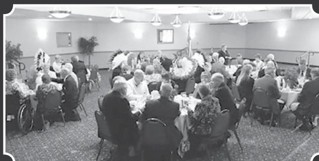
The Past Potentates were flocking to the banquet.

Postmaster: Send changes of address to Zor Zephyr 6510 Grand Teton Plaza, Suite 204, Madison, WI 53719