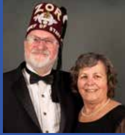
Chief of Staff