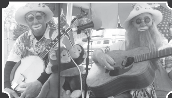
Zor Clowns first parade of the year.

save August 16, 2025 our Fort Winnebago 175th Anniversary Celebration date