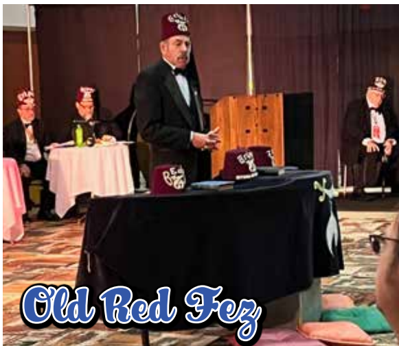
Old Red Fez