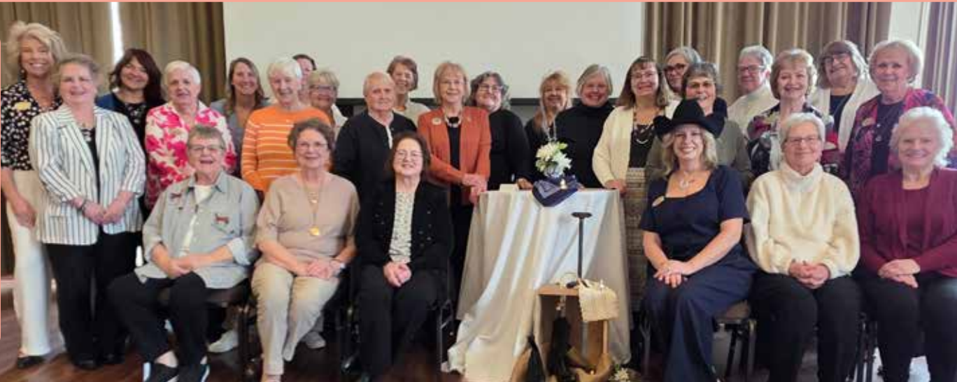
Honored Ladies Luncheon