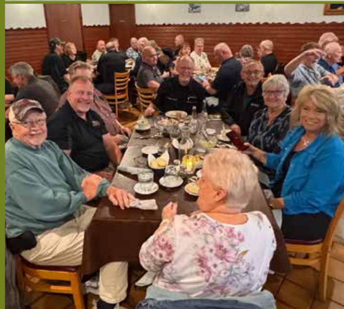
Friday night fish fry at Oliva's at Gulliver's Landing