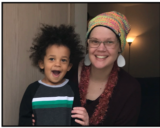
52 Families Assisted