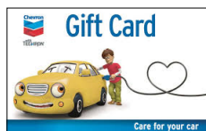
$2000 Gas Cards