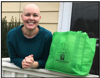
$16,907 852 Meals Delivered