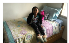
$11,393 Home Supplies and all other Program Services

*All of our numbers are itemized and available upon request.