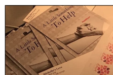
$5,200 52 Covid Gift Cards