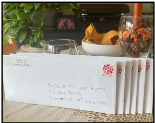
$70,225 Rent & Mortgage Payments