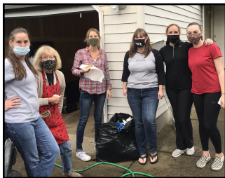
16 Volunteer Opportunities 286 Combined Hours