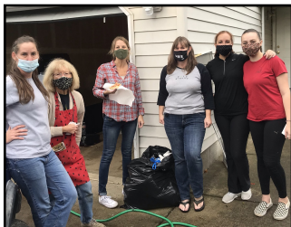
16 Volunteer Opportunities 286 Combined Hours