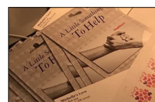
$5,200 52 Covid Gift Cards