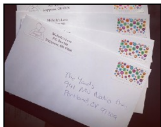
$71,678 Rent & Mortgage Payments