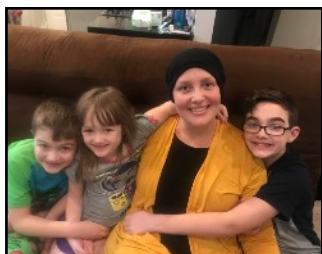
44 Families Assisted