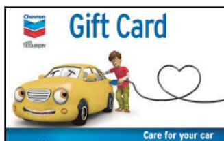
$3,500 Gas Cards