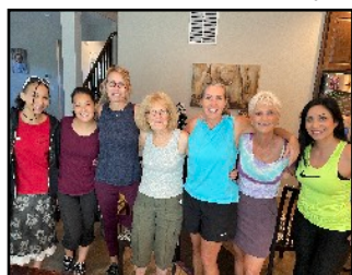
32 Volunteer Opportunities 110 Volunteers 537 Hours