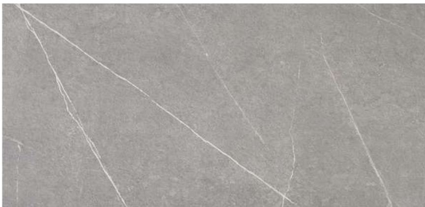
Tactile grey pul