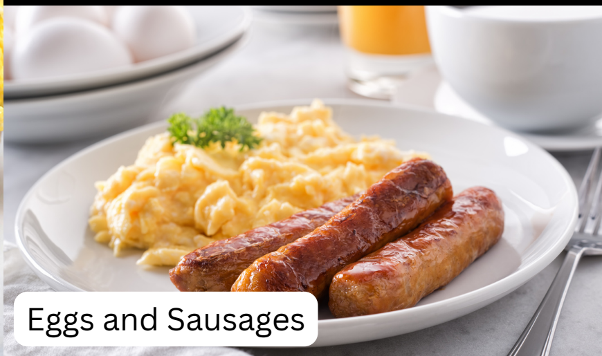
Eggs and Sausages