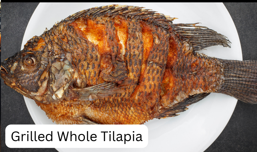
Grilled Whole Tilapia