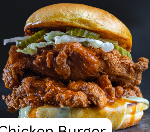
Spicy Chicken Burger