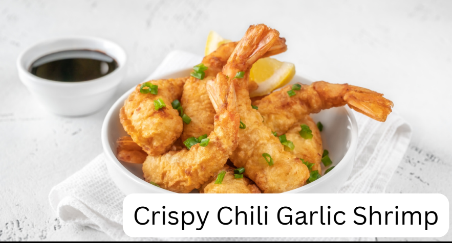
Crispy Chili Garlic Shrimp