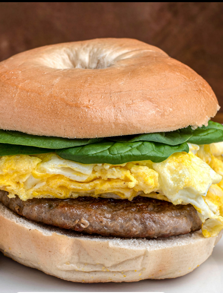
Egg & Sausage Bagels

a mother's love brews within the morning tea