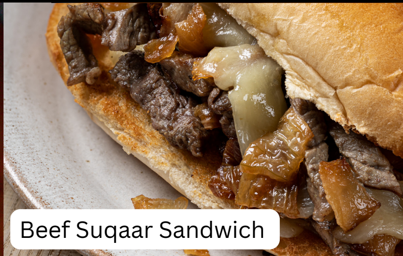
Beef Suqaar Sandwich