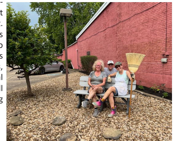
Our Volunteers after landscaping on Main Street