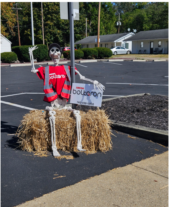
Boltaron's Hay Bale