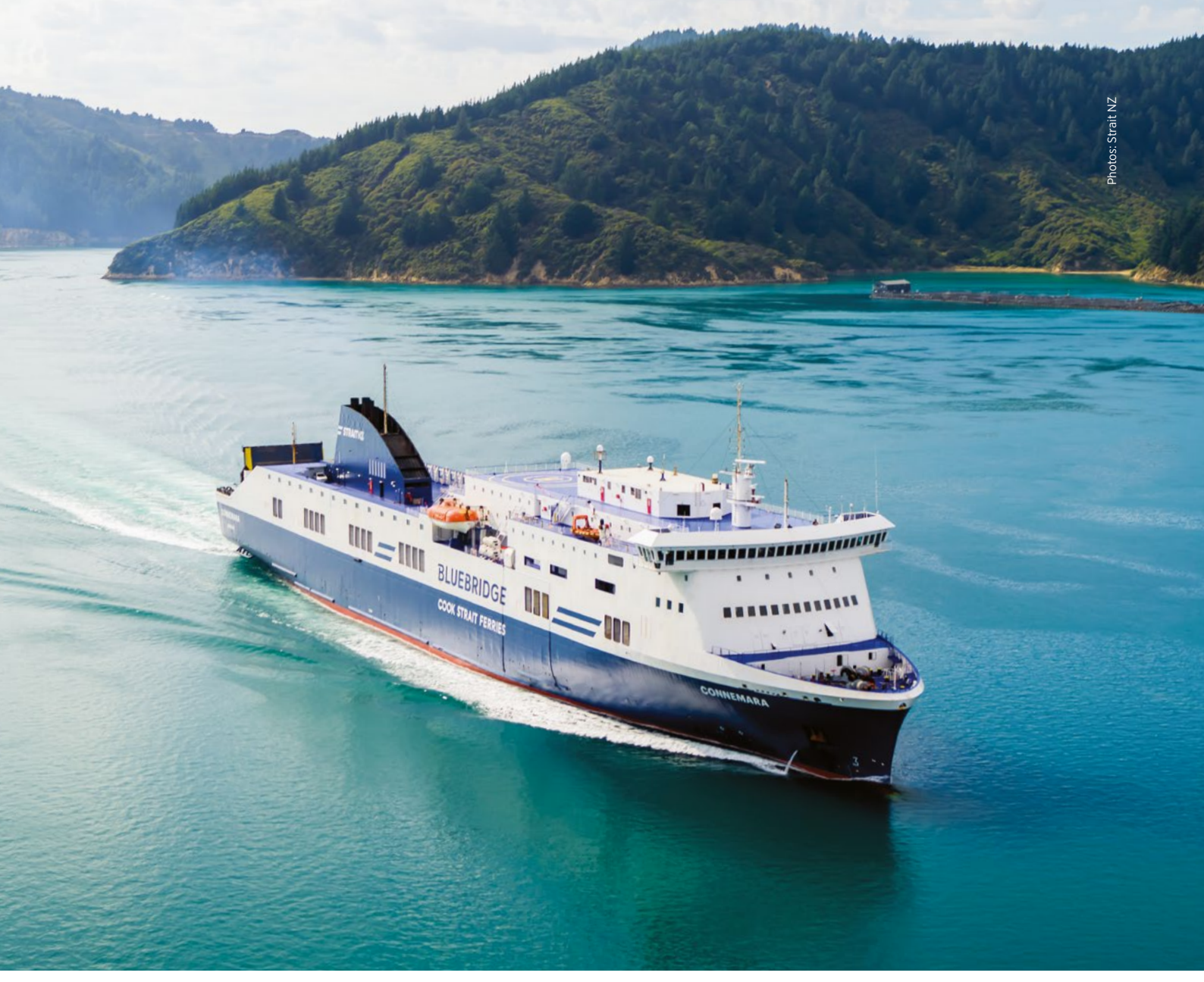
Acquiring Connemara has allowed StraitNZ to increase the number of passengers it takes across the Cook Strait

also providing enough space to allocate to passengers."