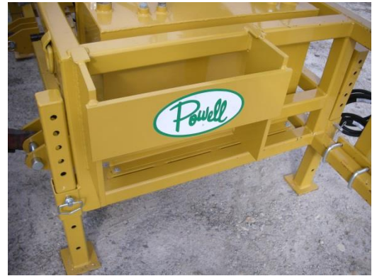
weight bar for tractor weights