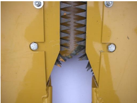
Gripper chain & Saw blade relationship