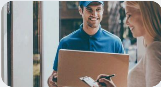
Door - Door Delivery

Custom brokerage | Freight forwarding | Warehousing | Transportation | Door to Door Delivery | Consultation | Insurance