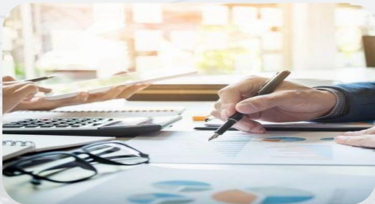
Consulting & Insurance

Transportation : Multi-mode services that optimize air, sea, land, and rail transportation, end-to-end solutions with a single contract and single point of contact. We have designed and manage end-to-end services that combine the separate strengths of air, sea, rail, road and inland waterways transportation, with high visibility.