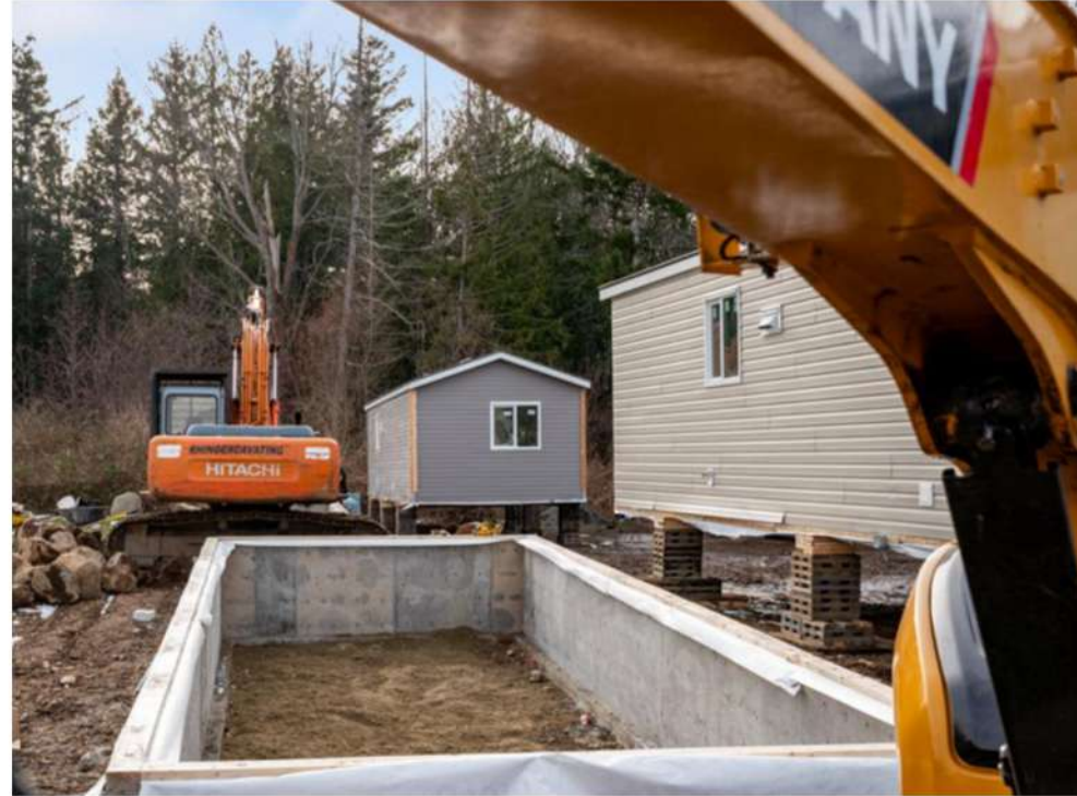
EXCAVATION AND FOUNDATION