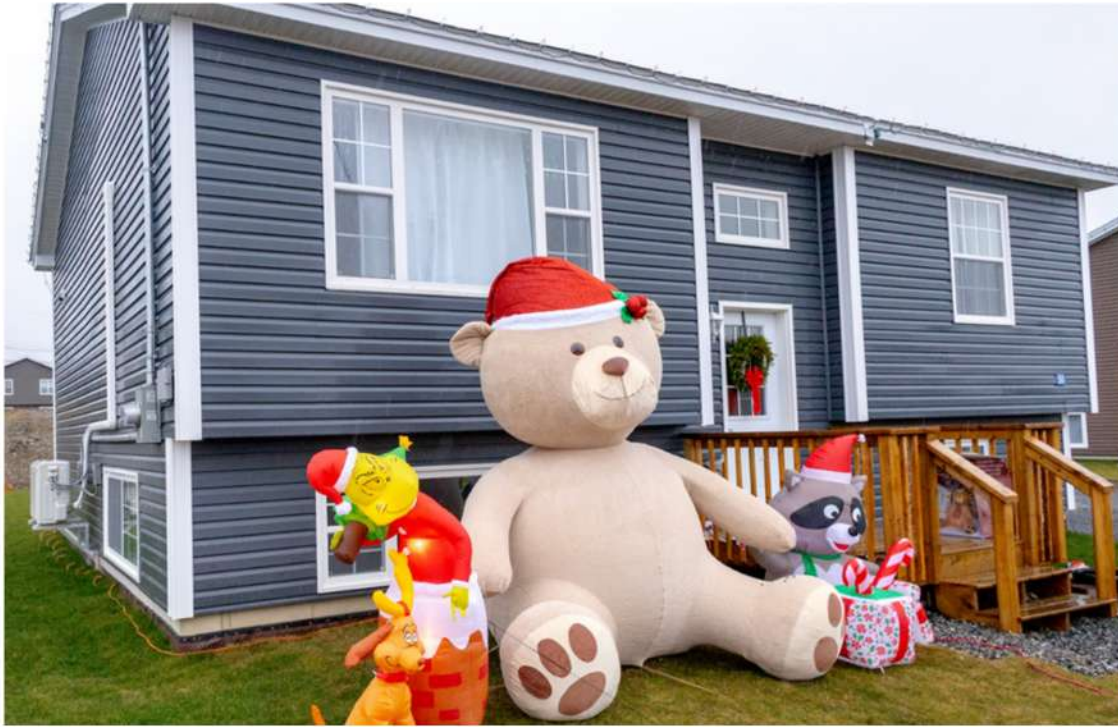
oCCUPIED 2000 SQFT SPLIT ENTRY , 2024.