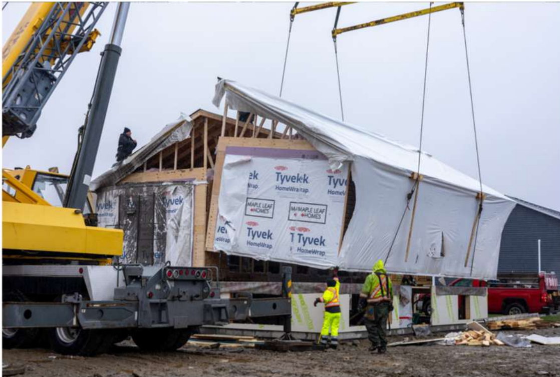
TWO (2), 2000 SQFT SPLIT ENTRY IN PROGRESS, 2025.