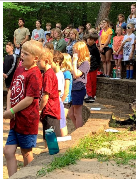
Campers during a presentation at Badger Youth Camp.

The SAL was blessed to have two 90-minute sessions that brought our program to about 150 children. We put on a small play, demonstrated the proper method for folding the Flag and had a wonderful Q&A session with them. This included several veterans who answered questions about being in the military.