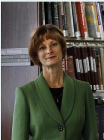
SONOMA COUNTY'S NEW LIBRARY DIRECTOR

The February 16th One-Day Book and Bake Sale has been rescheduled to Saturday, March 16th.