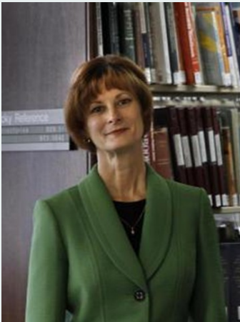
SONOMA COUNTY'S NEW LIBRARY DIRECTOR

The February 16th One-Day Book and Bake Sale has been rescheduled to Saturday, March 16th.