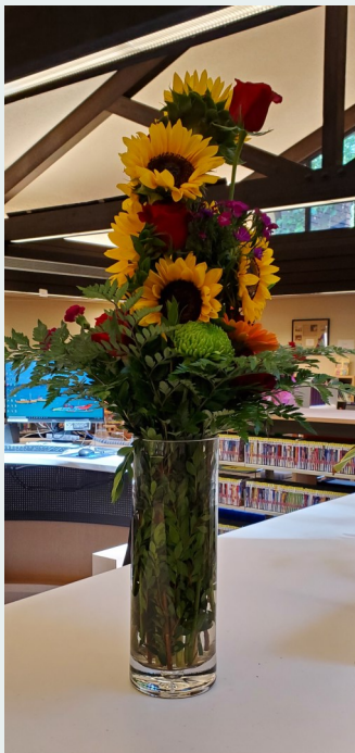
FLOWERS DONATED BY OUR LOCAL SAFEWAY

Our Halloween event will be Monday, October 31 from 3-5:30 p.m.