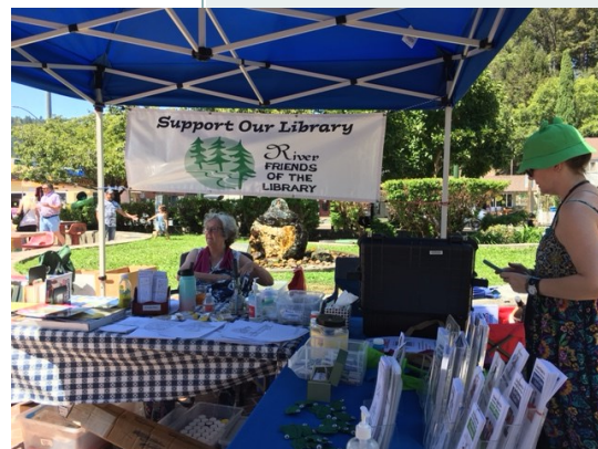
COME TOGETHER FESTIVAL

Besides the usual informational flyers and brochures, we handed out free books, coloring pages, bubbles and tote bags. The free books and some of the bags were donated by the Library.